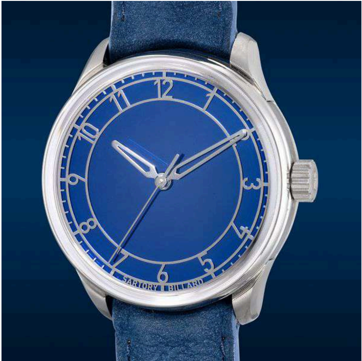
Sartory Billard SB04 Unique Piece, in steel with heat-blued titanium dial; Estimate: HKD $24,000 - 48,000

All examples of the SB04 feature the same overall case shape (40mm × 11.5mm), in steel or titanium, that was designed by Billard to be simple in construction but complex in appearance, with a mixture of brushed and polished finishes and short lugs that give the appearance of being soldered on but are actually attached to the caseback. The standard SB04 case is milled using CNC machines and sourced from a Swiss supplier, while dials, chapter rings, and other customizable components are produced by Billard himself using laser cutters and traditional machinery, including a Schaublin lathe, a favorite of independent watchmakers throughout Switzerland and beyond.