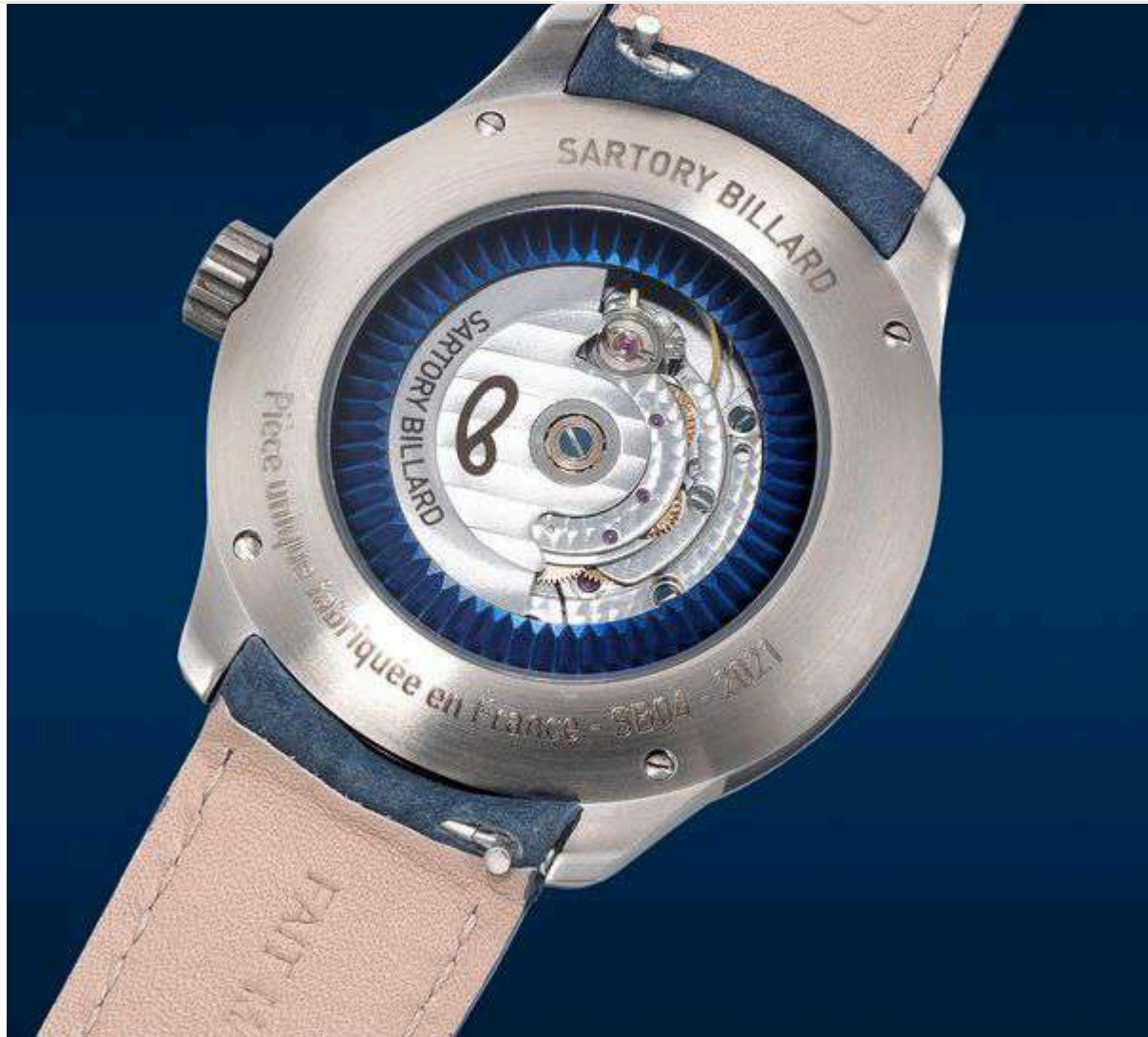
The La Joux-Perret G100 caliber inside the Sartory Billard SB04; Estimate: HKD $24,000 - 48,000

There's a long history of customization in high-end watchmaking, but it's typically only available to the wealthiest collectors. The SB04 changed that in a big way. With a base cost of 3,000 euros, Sartory Billard effectively democratized the personalization process.