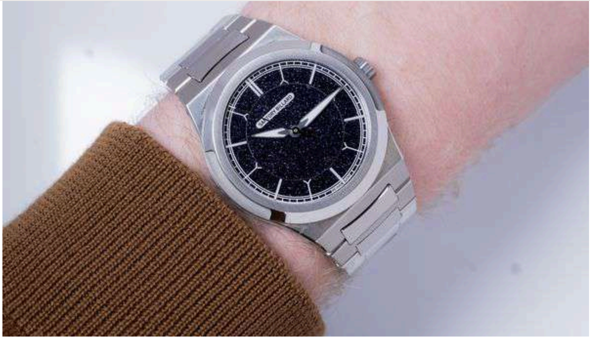
The recently announced Sartory Billard SB07 sport watch, with a unique aventurine dial.