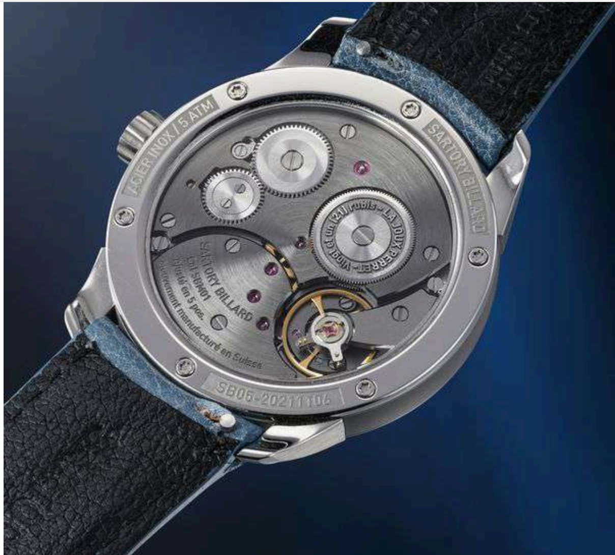
The manual-wind La Joux-Perret caliber 7381 inside the Sartory Billard SB05.