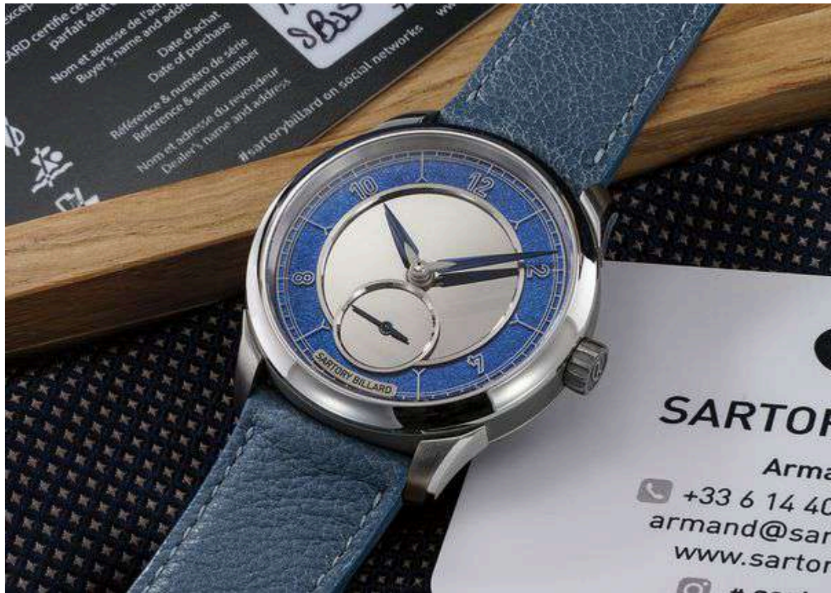
Sartory Billard SB05 Unique Piece, sold during Geneva Watch Auction: XVI for CHF 13,860

A second Sartory Billard watch was included in our Hong Kong Sessions, Spring 2023 online auction, a third in the Geneva Watch Auction: XVII , and a fourth in our ongoing Geneva Sessions, Fall 2023 online auction, so I figured it was about time we dug a bit deeper to see what the brand is all about.