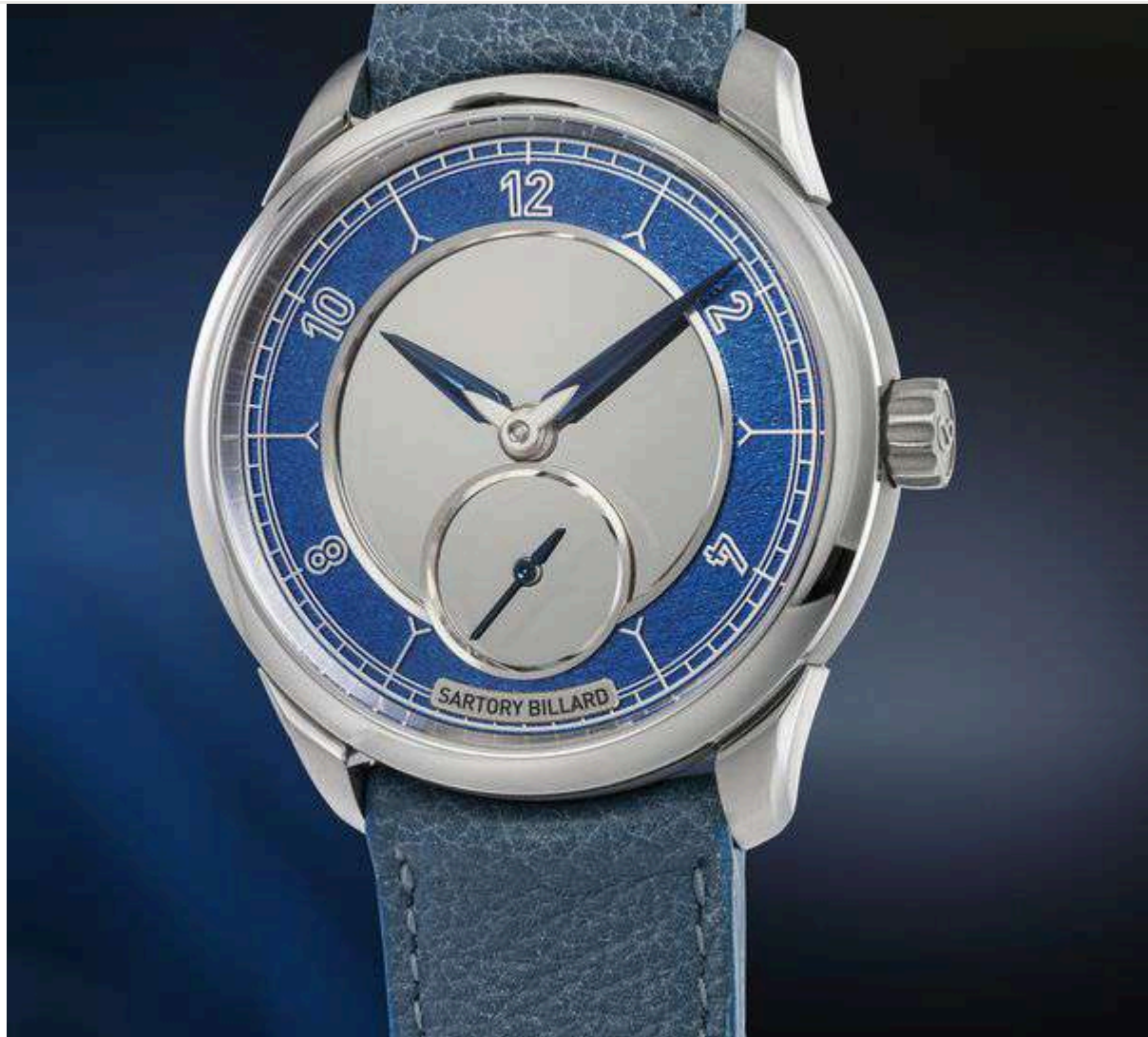
Sartory Billard SB05 Unique Piece, sold during Geneva Watch Auction: XVI for CHF 13,860

Billard worked closely with Comblémine and Cattin, the casemaker owned by Voutilainen, on the execution of the SB05. Cattin designed a new, more complex case for the SB05, which incorporates 20 parts compared to the seven on the SB04, and Comblémine assembles each watch after receiving finished movements from La Joux-Perret.