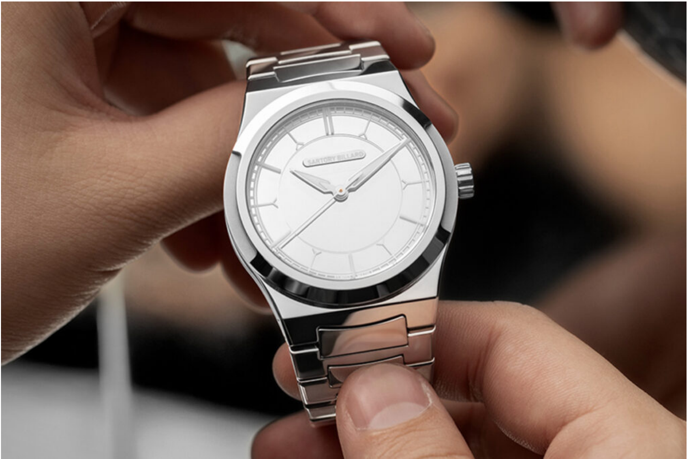
Grail Watch 11: Sartory Billard SB07 "Ghost"

Grail Watch 11: Sartory Billard SB07 "Ghost" is available for public purchase now . Available in a limited edition of fifteen pieces, it is priced at EUR 9,950 each . For enquiries, email shop@grailwatch.com .