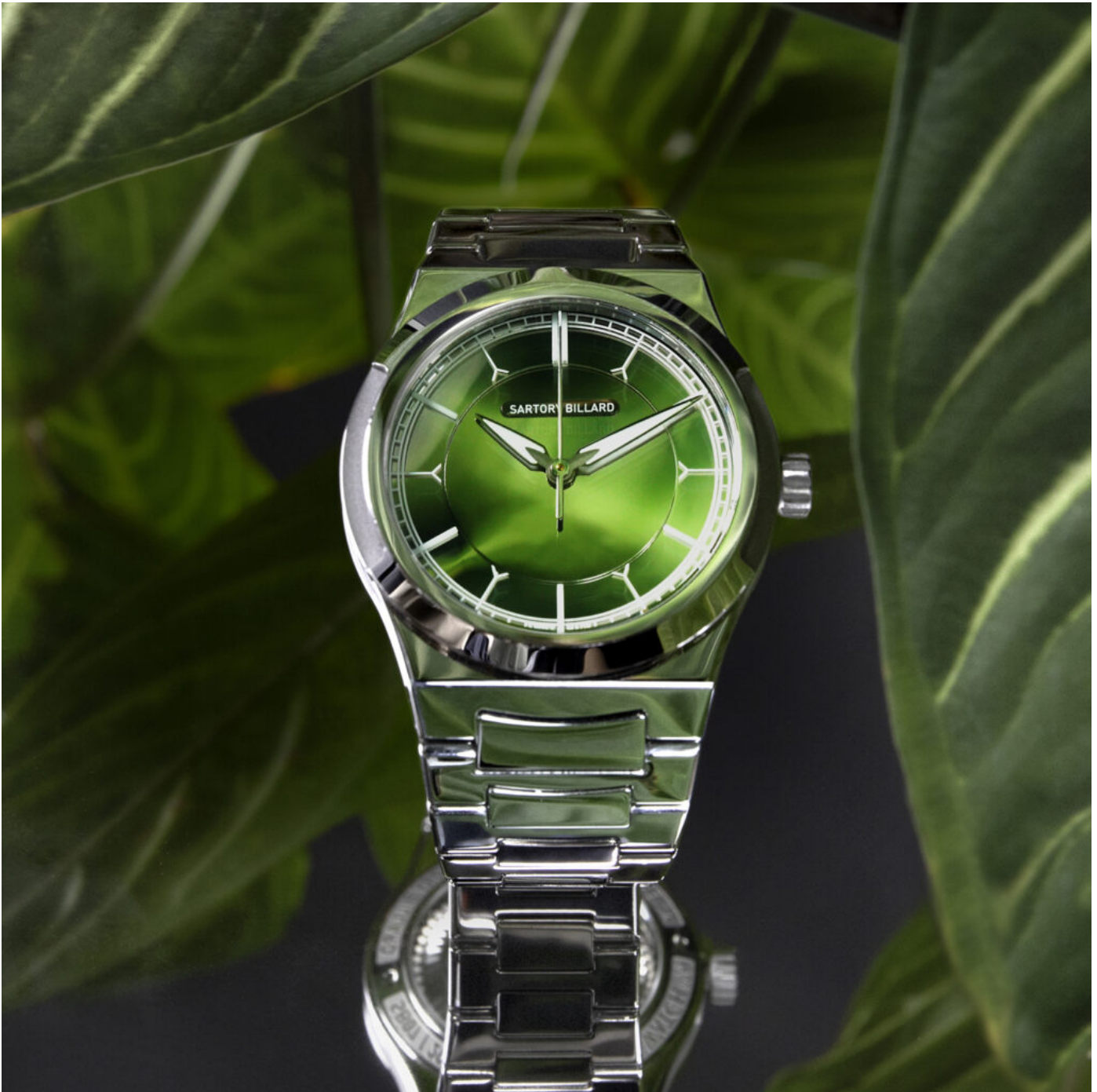
Grail Watch 11: Sartory Billard SB07 'Ghost'

That timepiece showcased a fully polished bracelet, case and dial, topped by a sapphire crystal featuring a metallized dotted pattern, which did as much to add visual interest to the dial as it did to somewhat subdue the visual impact of the watch. Then when Sartory Billard introduced its first steel sports watch with an integrated bracelet last year, we saw the opportunity to create a watch that was completely mirror polished, and moreover, fully unencumbered, for maximum impact.