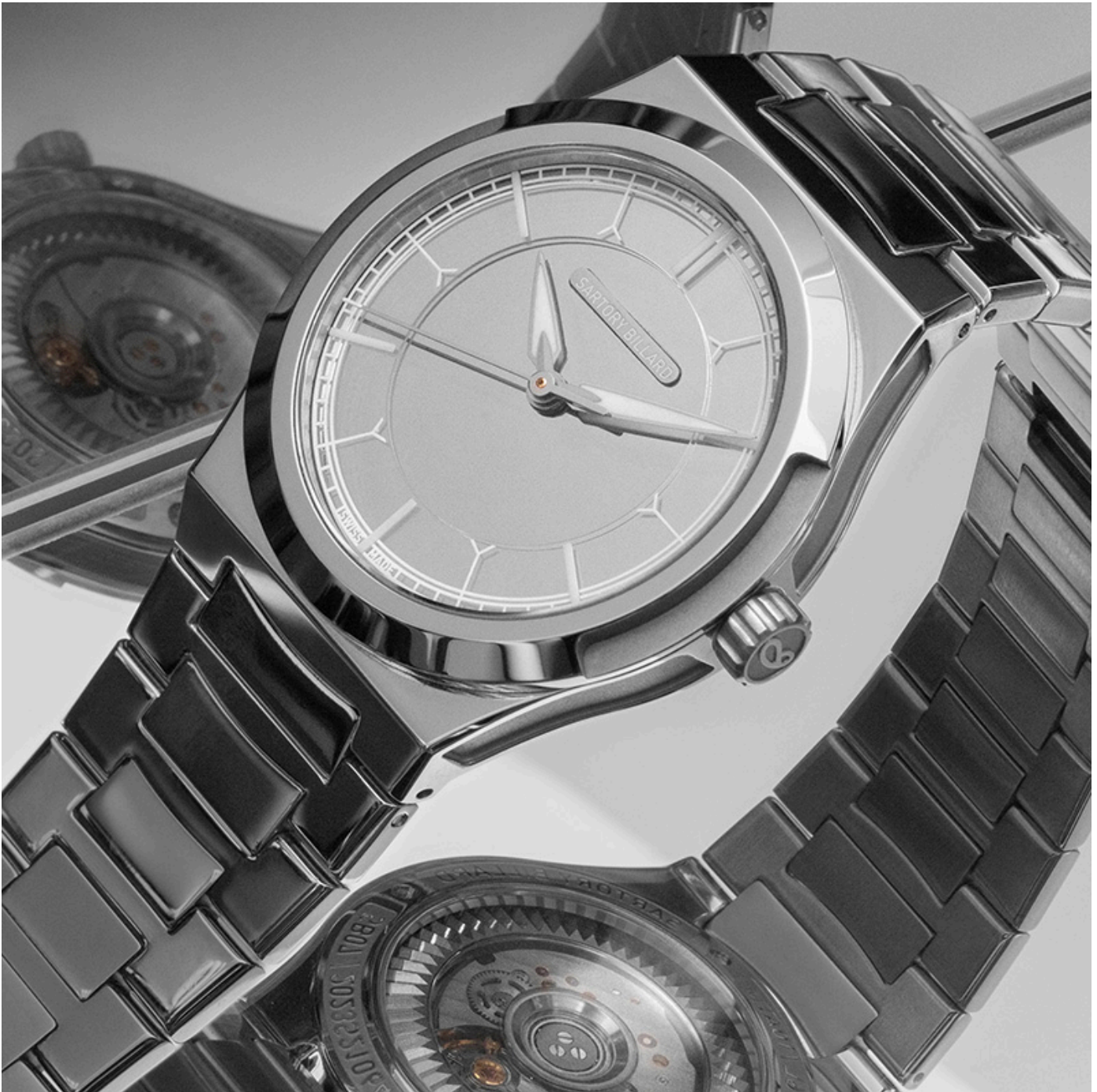
Grail Watch 11: Sartory Billard SB07 'Ghost'

However, on the SB07 “Ghost,” they are entirely polished while retaining the microblasted notches on the bezel and recesses of the case flanks. This works to help break up its verticality, reducing the perceived height of the watch. The case measures 40mm in diameter, 48mm lug to lug and is 10.65mm high. Notably, due to the integrated bracelet design, like the Royal Oak, the lugs flare out slightly. However, it will fit wrists as small as 15.5cm.