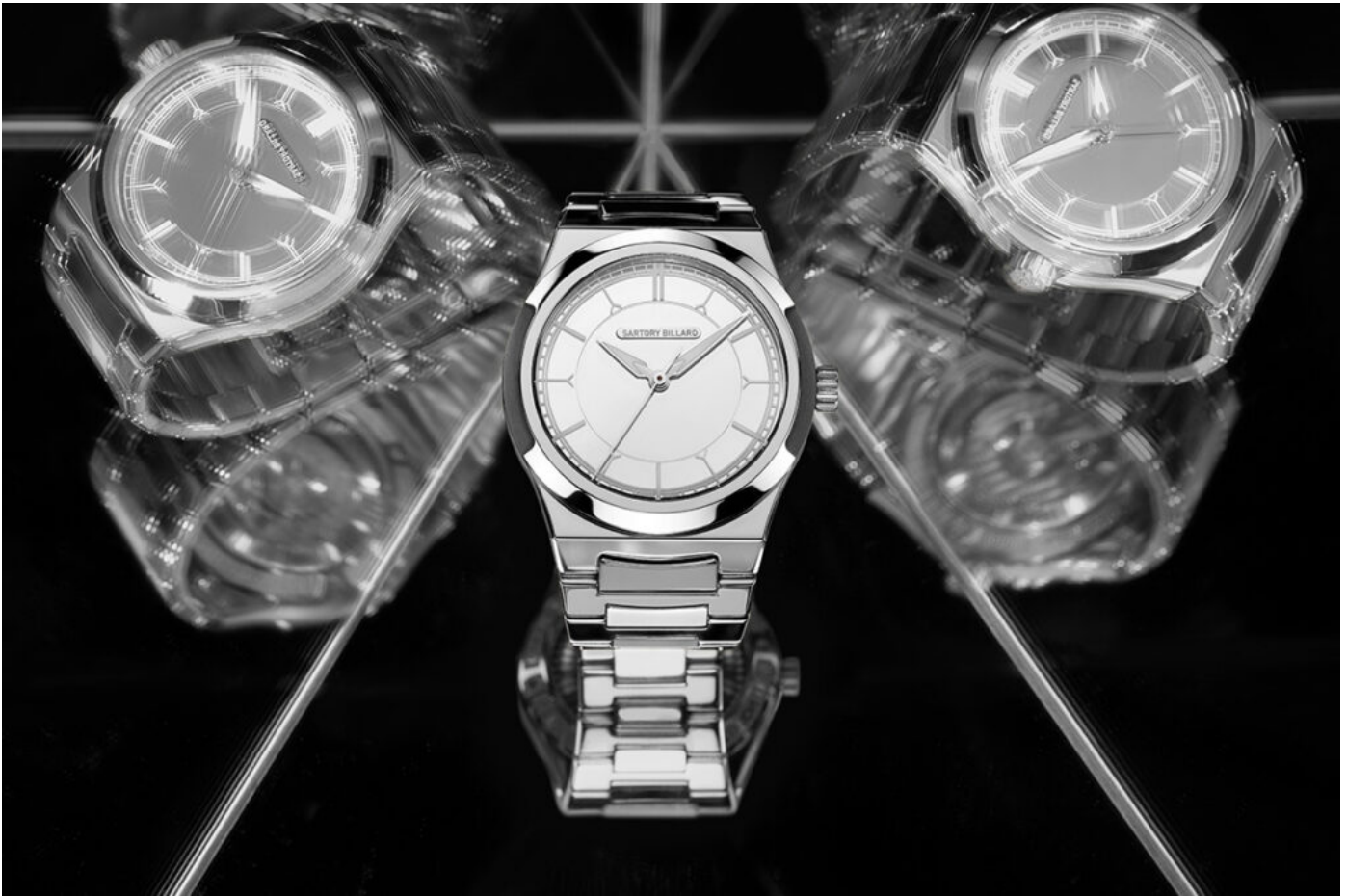
Grail Watch 11: Sartory Billard SB07 'Ghost'

Available in a limited edition of 15 pieces, the Grail Watch Sartory Billard SB07 “Ghost” is a watch that invites the wearer to be curious and to indulge in its distinct design. Sports-worthy with a depth rating of 100 meters, the watch case consists of three parts: bezel, case flanks and display caseback. The case flanks feature a recessed portion, while the bezel has two wide notches. On the standard SB07 model, this allows for three different kinds of finishing: satin brushing on the top surface of the case and bezel, polishing on the bezel rim, and microblasting on the recessed areas of the flanks and bezel notches.