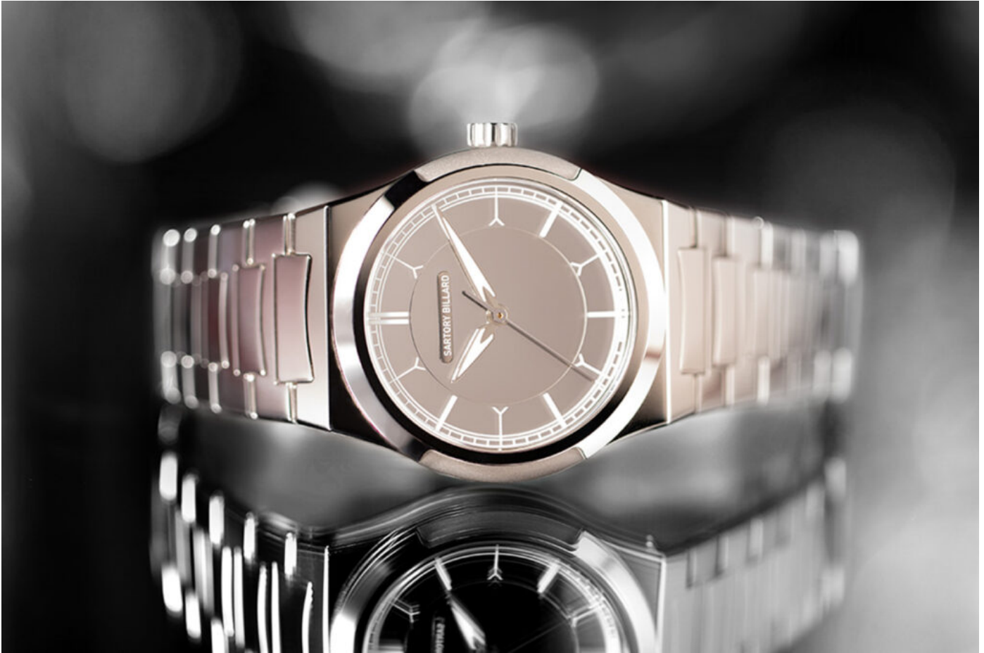
Painstakingly hand polished, the perfect mirror finish is dazzling under all lighting conditions

process is crucial in creating an even and distortion-free surface. Armand shared that 170 dials were produced to arrive at 15 perfect ones.