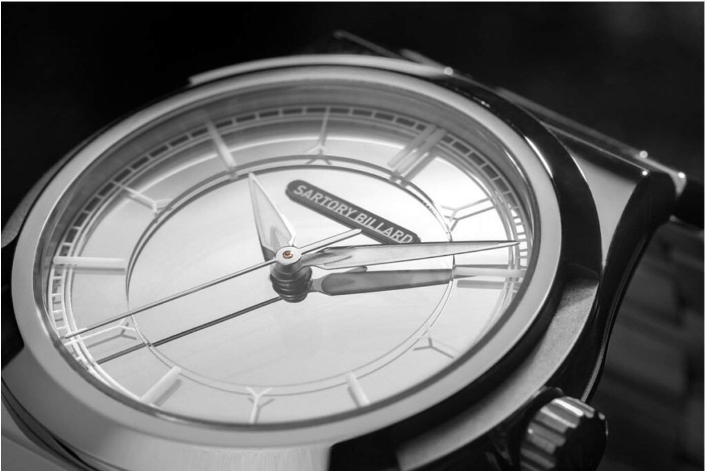
Microblasted notches on the bezel beautifully contrast with the case's mirror polish

Once the desired level of polish is achieved, the lacquer is then removed and the dial is cleaned again to remove any remaining polishing compound or residue. Proper care is also essential post-polishing. Polished surfaces have fewer irregularities, allowing dust to settle more easily on the surface. They can also develop a slight electrostatic charge, especially when they are rubbed or cleaned, which attracts dust particles from the surrounding environment. As such, assembling the watch in a dust-free environment is all the more essential here.