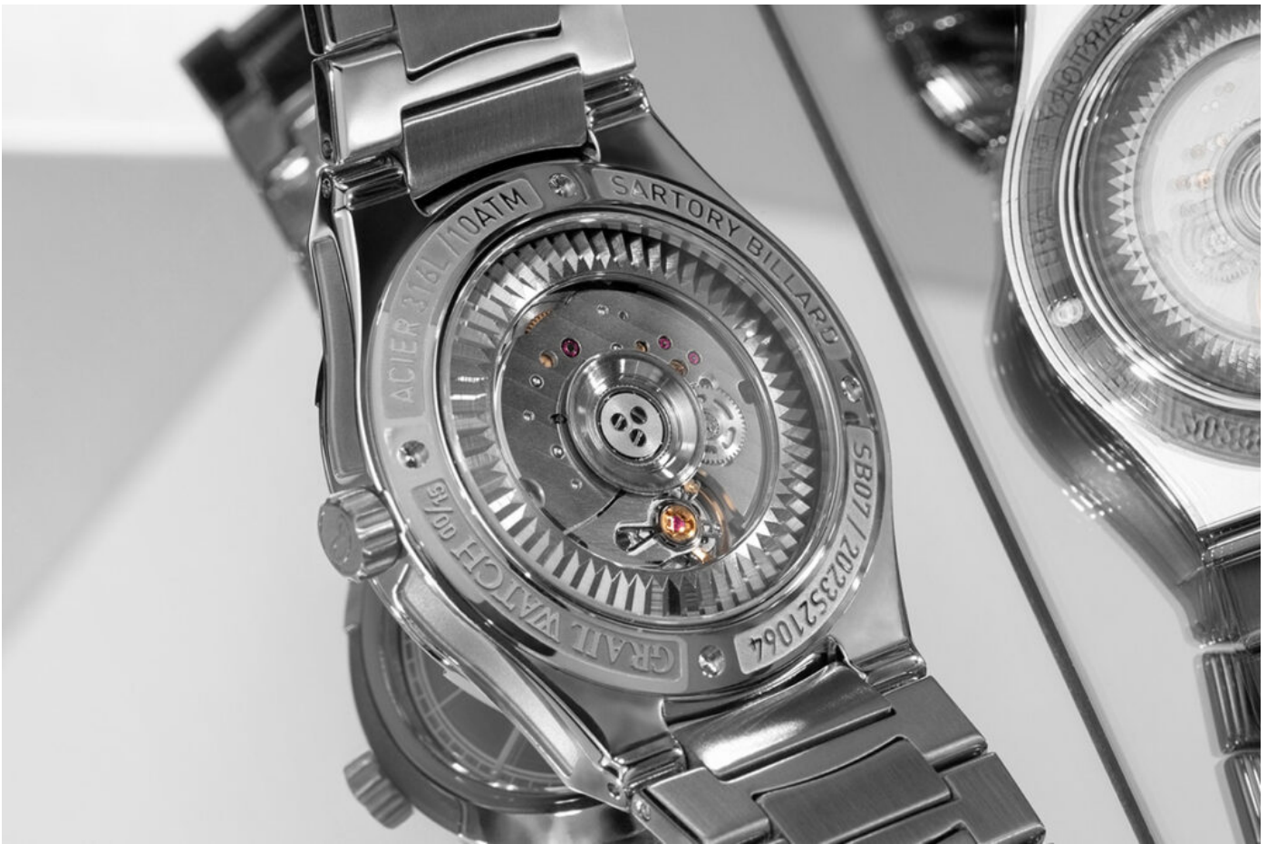
The customized "mysterious" rotor allows full viewing pleasure of the La Joux-Perret automatic G100

Although it has the same frequency of 4Hz and similar dimensions to the others, it offers a much longer power reserve of 68 hours. Additionally, the rotor hub is secured to the bridge with three screws which is rarely seen on movements of its ilk. The finishing is cleanly executed with perlage on the baseplate, striping on the bridges, along with the added flair of fluting on the outer rim of the rotor.