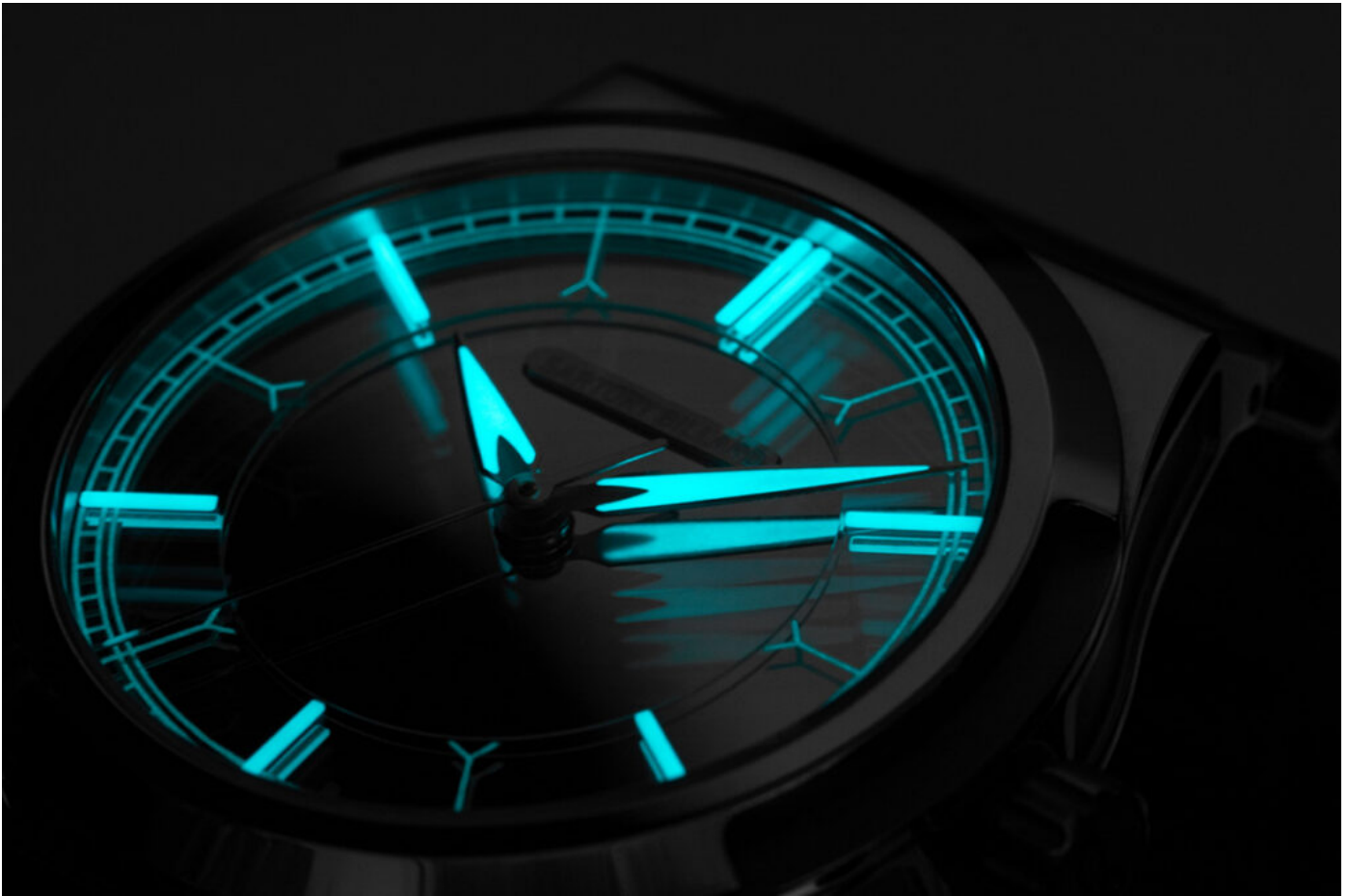
Molded SuperLumi-Nova applied on hands and odd indexes

The highly polished face of the SB07 “Ghost” is contrasted with its luminescent hands, indexes and minute track. Super-LumiNova is molded to form baton indexes, which are applied over the dial. The minute track, on the other hand, is pad-printed with Super-LumiNova on a sapphire crystal disk that is superimposed over the dial, and the hands are filled with Super-LumiNova.