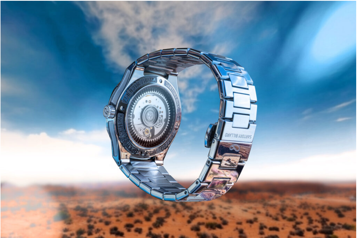
Grail Watch 11: Sartory Billard SB07 'Ghost'

By achieving a flawless mirror polish throughout the bracelet, case and dial, steel becomes almost invisible – hence, the sobriquet “Ghost” was also chosen for our watch. This allows the architectural design of the watch to take center stage. The result, interestingly, does not feel so much like a new iteration of an existing watch as it does an entirely new objet d’art.